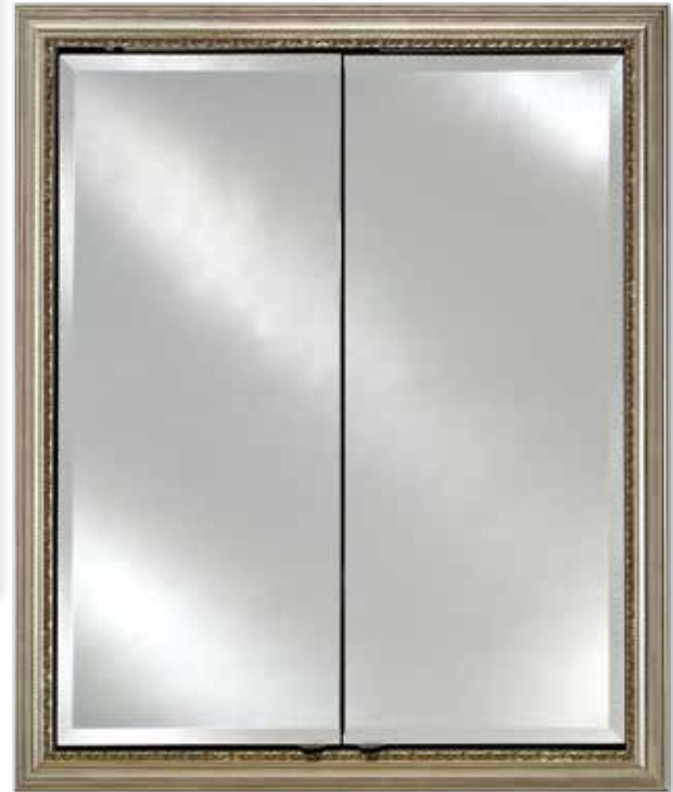
▶ Shown In: Parisian – Silver

Available in over 40 frame styles & finishes in the following sizes: