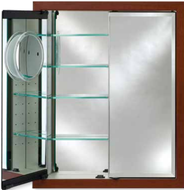
▶ Shown In: Arlington – Honey w/ (optional) magnifying mirror (MM)

◀ Detail of 3/8" thick tempered high polished glass shelves